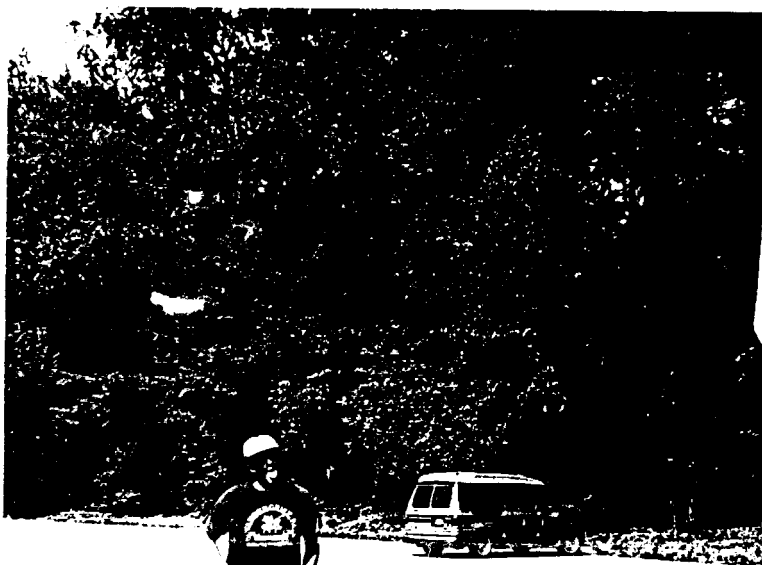
ANDY GERO PICNIC RUN 1997