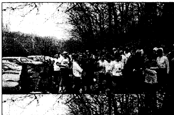
Start - 1999 G-U-T-B-U-S-T-E-R